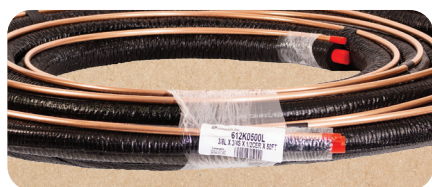
FULL ASSEMBLY LINE SET