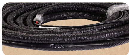
MINI SPLIT LINE SET

Linesets, Inc. is the industry leader in HVAC line sets. Our ongoing commitment to listening and working with our distributors and their contractor customers allows us to provide innovative solutions of the highest quality and value. Every product design we offer reflects our many years of industry insight and service excellence.